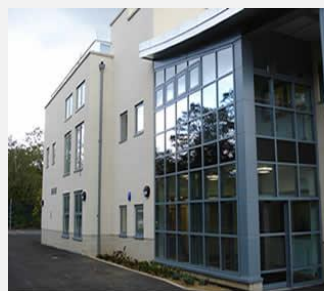
Sports Block side view