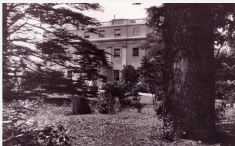
Front Lawn with Trees still in place

In 1919 the front lawn was surrounded by trees and bushes, and at the back a tree was cut down when the field was levelled for sports. The tree was incorporated into the school badge.