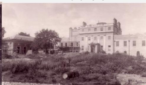
Building the Hall in 1929

In 1929 the School was bought by Essex County Council and a commemorative inscription was put over the fireplace in the front hall.