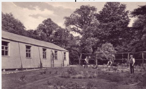
First Hall Gym