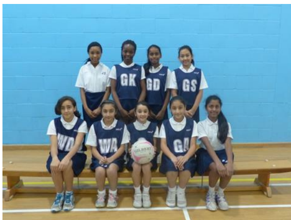
Year 7 3 rd Place