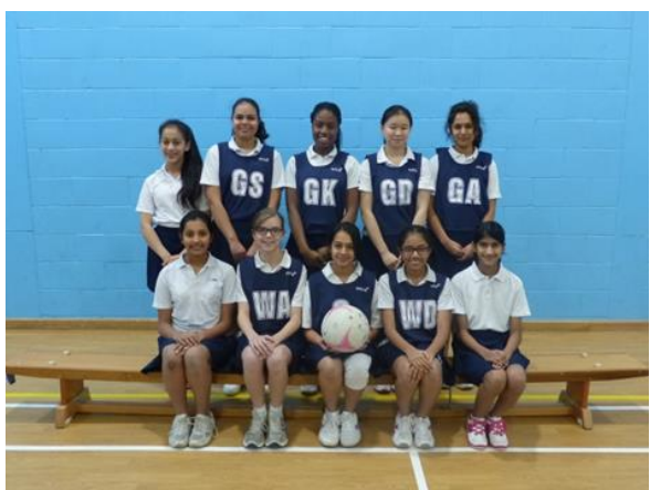
Year 9 6 th Place