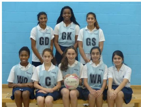
Year 8 – 1 st Place (see article)