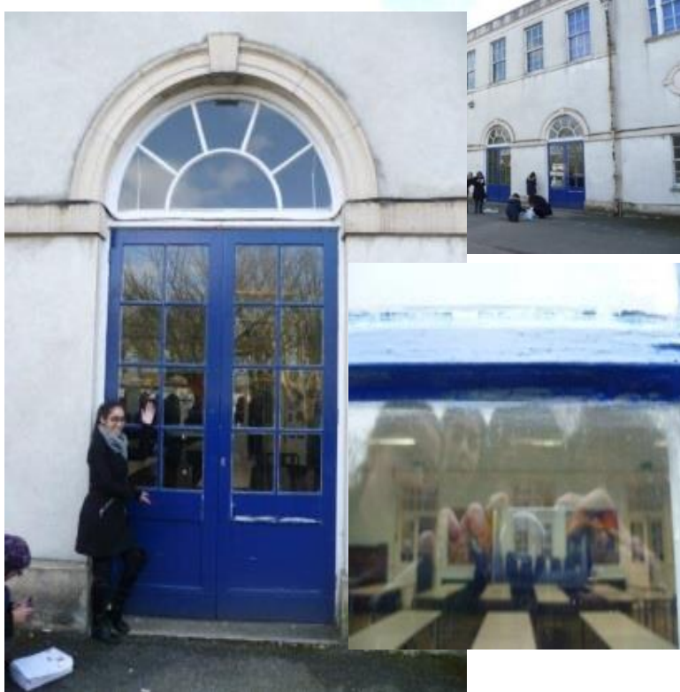
A – glass windows Dining Hall

Pictures: The external surfaces where samples were taken: