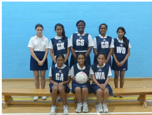
Year 10 4 th Place