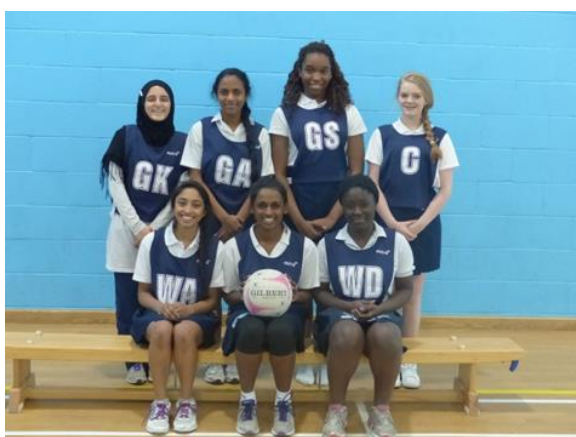
Year 11 Squad