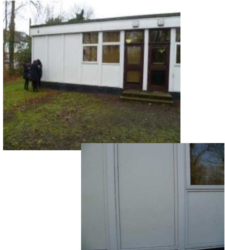
C – 6th Form Block wall

We got confirmation that the samples arrived safely! In a few weeks we should have the sequencing results back so the students can then analyse them.