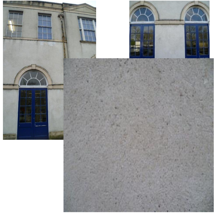
B – External wall Dining Hall