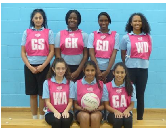
6 th form Squad