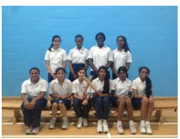
Year 8 team = 1<sup>st</sup> Place