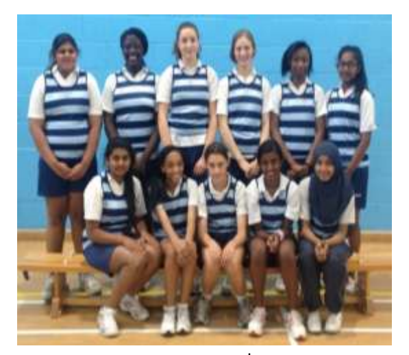
Year 8 team = 3<sup>rd</sup> Place