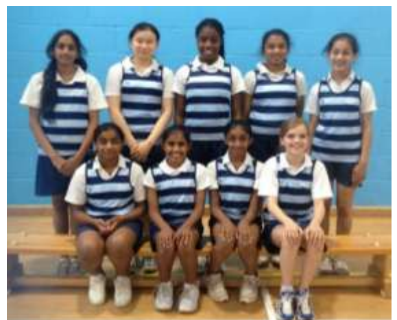
Year 7 team = 6<sup>th</sup> Place