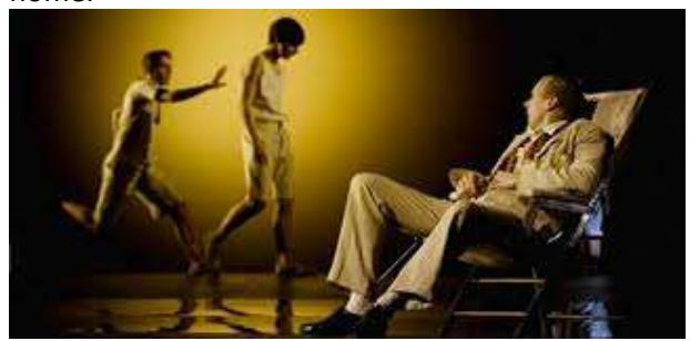
The trip was a great success - an introduction to the world of opera and it will certainly be of much use later on in our A Level course.

The plot centres on an elderly writer (Aschenbach) seeking inspiration in Venice to liberate himself from his writer's block. After developing a keen interest in a young boy of 15, Aschenbach is torn between his personal feelings and the morality of society. A true Britten tragedy, Aschenbach eventually dies of a cholera epidemic and his romantic interest returns home.