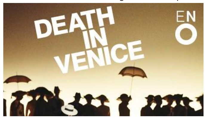
watch the company's latest performance of Britten's "Death in Venice".

As a perfect introduction to our A2 course, year 12 music students set off to the English National Opera to