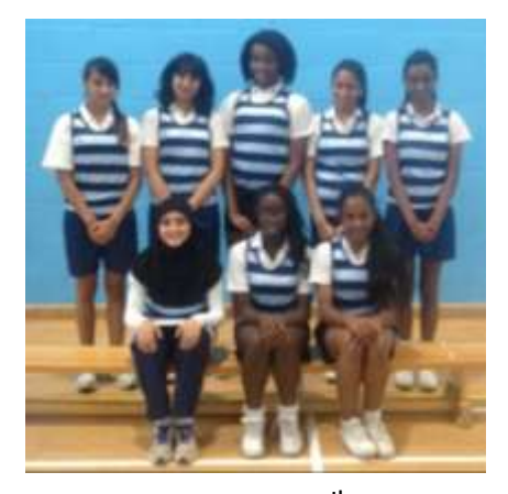
Year 9 team = 5<sup>th</sup> Place