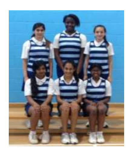
Year 10 team = 3<sup>rd</sup> Place.