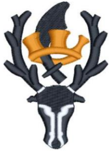
Chingford Cricket Club