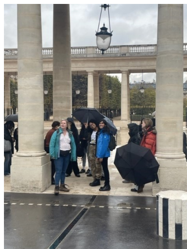
Rain did not dampen our spirits in the Gardens of the Palais Royal