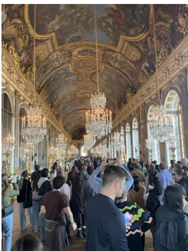
Breathtaking Hall of Mirrors @ the Chateau de Versailles