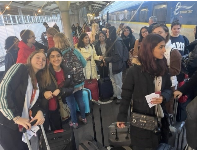
Fresh faced upon our arrival & ready for a Parisian adventure!

We also accompanied an expert guide in a walking tour of some of the sights of the Revolution, from Robespierre's home to the 'Place de Revolution' where so many Royals and their allies lost their heads, including Marie Antoinette.