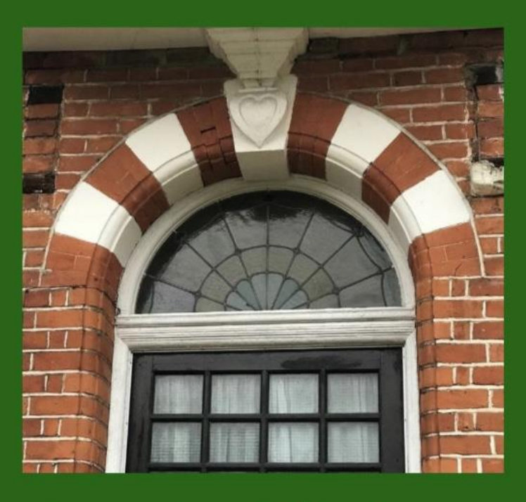
Saturday 15th July

at Woodford County High School (Highams)