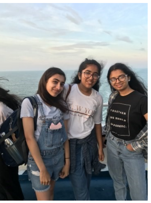
Page 2 of 2