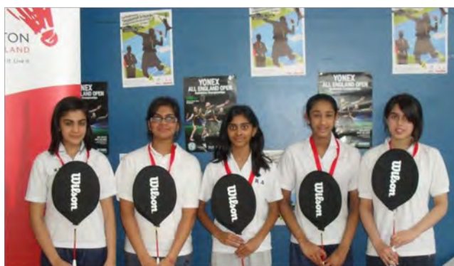
The Key Stage 3 team collecting their medals at the Regional competition