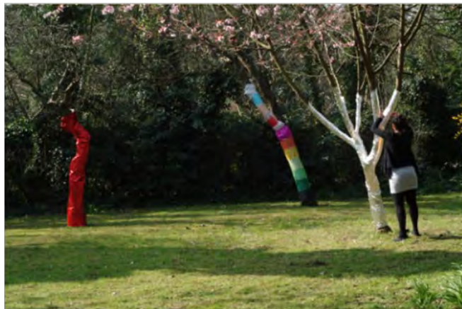
Simranjit Seehra Year 10 installation view of GCSE art project on 'Preservation'